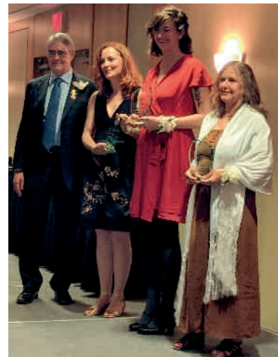
Celebrating Excellence in Health Promotion with the Doctors of BC

2. Disability Planning Helpline: One-on-one support provided by expert advisors on key future planning and RDSP information. Call 1-844-311-PLAN to contact the Helpline.